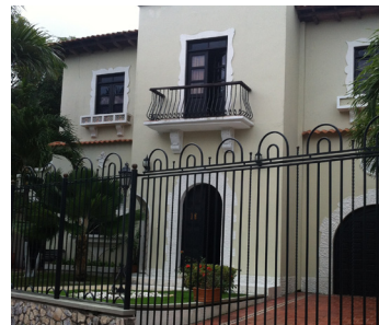
Encounter House exterior

Encounter House is modest but clean and has dining areas, comfortable social areas, and a conference room with air conditioning and sound system. The Encounter House staff are friendly and work hard to offer their guests an enjoyable experience.